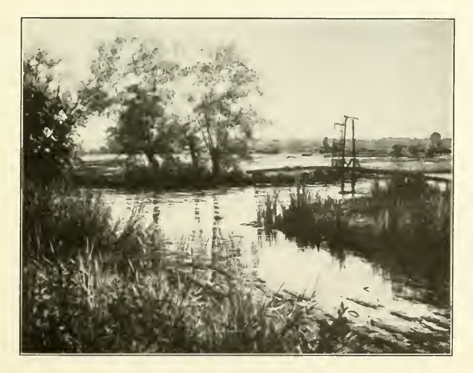
THE FOOTBRIDGE, BY ASTOR KNIGHT